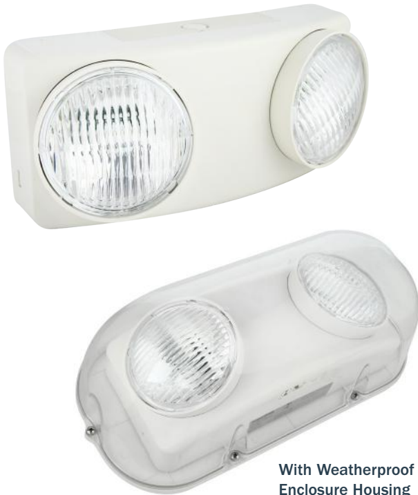
With Weatherproof Enclosure Housing

ADJUSTABLE LENS OF OUR TWIN-SPOT IS PERFECT FOR HIGH RISK APPLICATIONS AND LARGE OPEN AREAS.